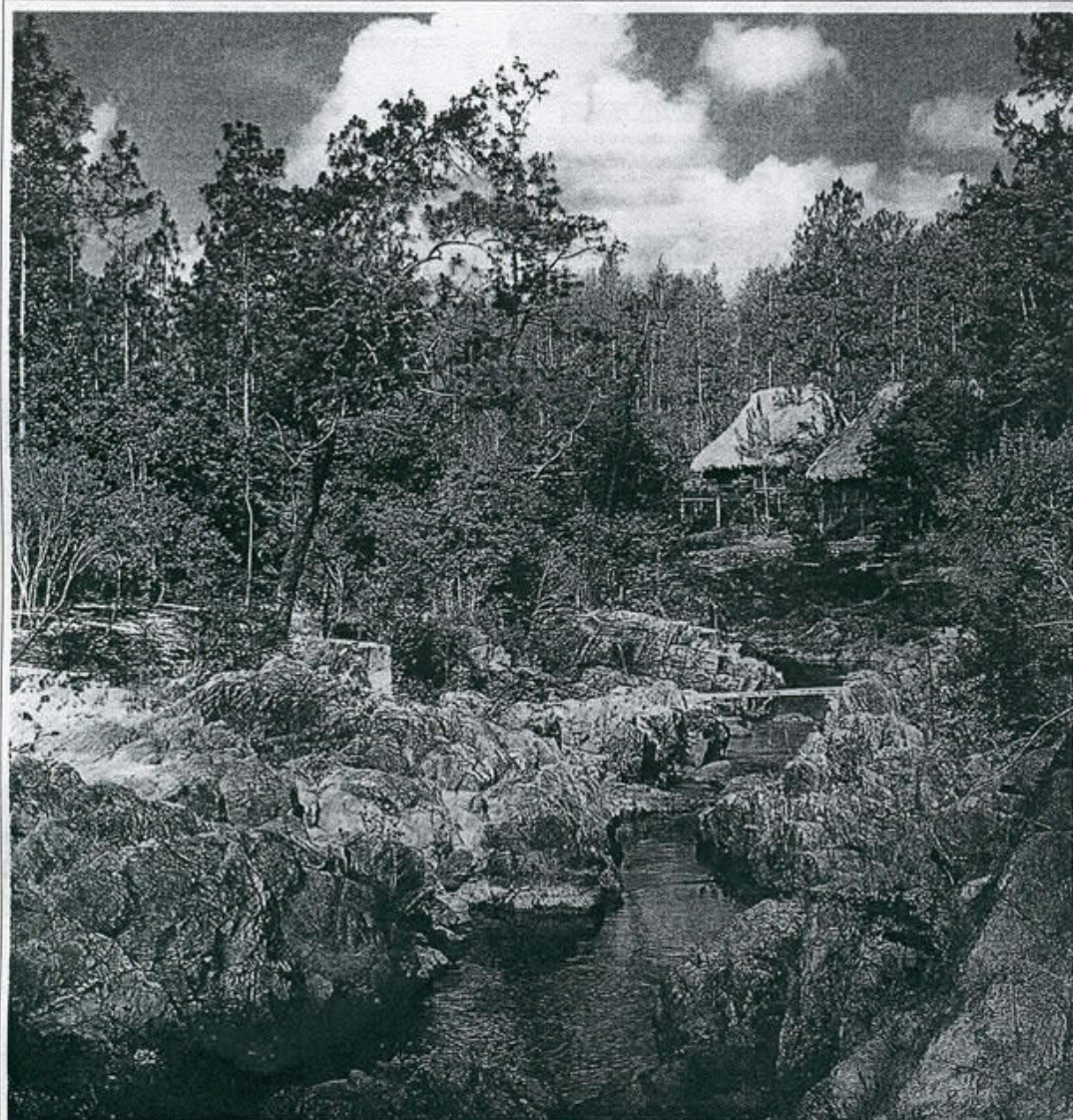
Act one: Francis Ford Coppola, inset, far right, went looking for a jungle retreat after filming 'Apocalypse Now'. He found the Blancaneaux Lodge in Belize

Blancaneaux Lodge has a tranquil atmosphere, which envelops you as soon as you shed your city clothes and your worries. The spa, the hot pool, the sound of the river all lull you into a peaceful state that lets you recon-