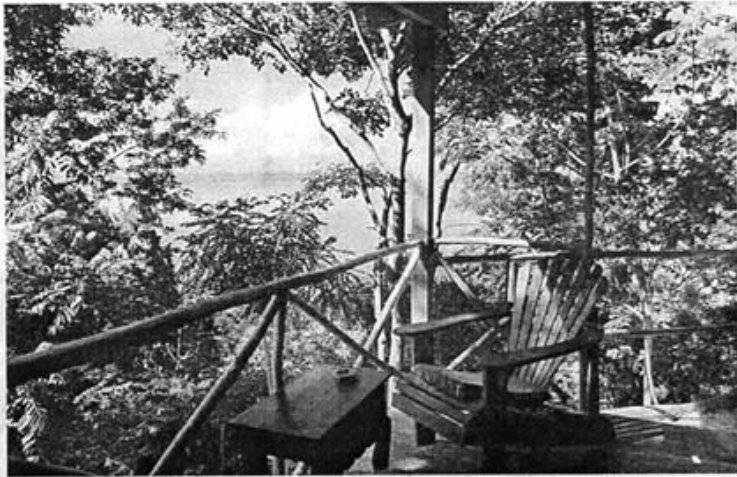
On location: the new, post-hurricane Turtle Inn, Belize, has 'Shellphones' - giant conch shells that act as intercoms - in its cabanas, above left. The more rustic La Lancha, in Guatemala, is close to the ancient Mayan city of Tikal

nect with yourself and your companion, and stimulates creativity - I find it easy to write there. The riverfront cabanas have expansive decks with wrap-around walkways that ensure a dramatic view of the river. The garden cabanas have large, screened porches with hammocks. All are themed with native art and local textiles and hand-painted tile baths.