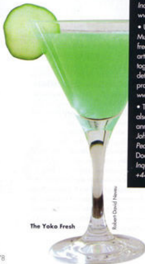
The Yoko Fresh

Several guests have reported experiencing a mystical aura when staying overnight in the suite. Otherworldly or not, there's no doubt that some powerfully charged historical and musical residue remains but, sadly, the carpet of flower petals has long since gone. □