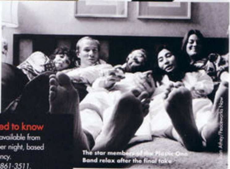
The star members of the Plastic Ono Band relax after the final take

How about scrambled eggs with crispy bacon and grilled tomatoes, vegetable salad or maybe fillet of sole? Or you may like to try one of John's favourites: 'Spanish Smiles' – that's orange juice with honey (but no eggs) and, of course, staying true to his Northern English roots, lots and lots of black tea.