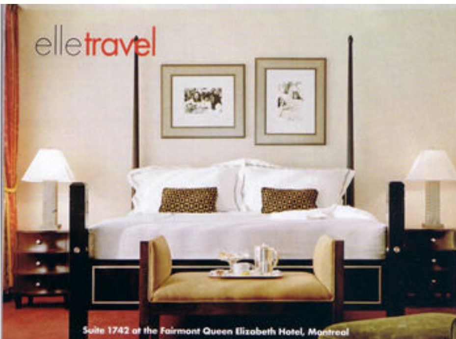
Suite 1742 at the Fairmont Queen Elizabeth Hotel, Montreal